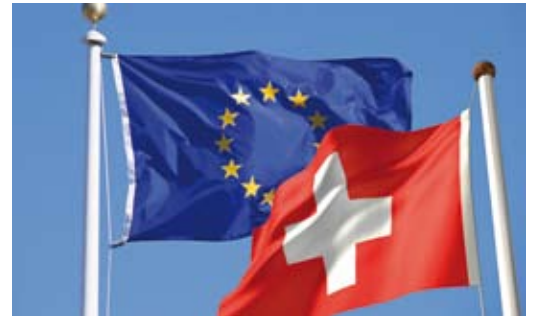
No new safety measures for bilateral goods traffic between Switzerland and the EU.

The summary declaration is the third pillar of this security concept. A summary declaration must be submitted for goods which are imported into or exported from the EU-customs territory.