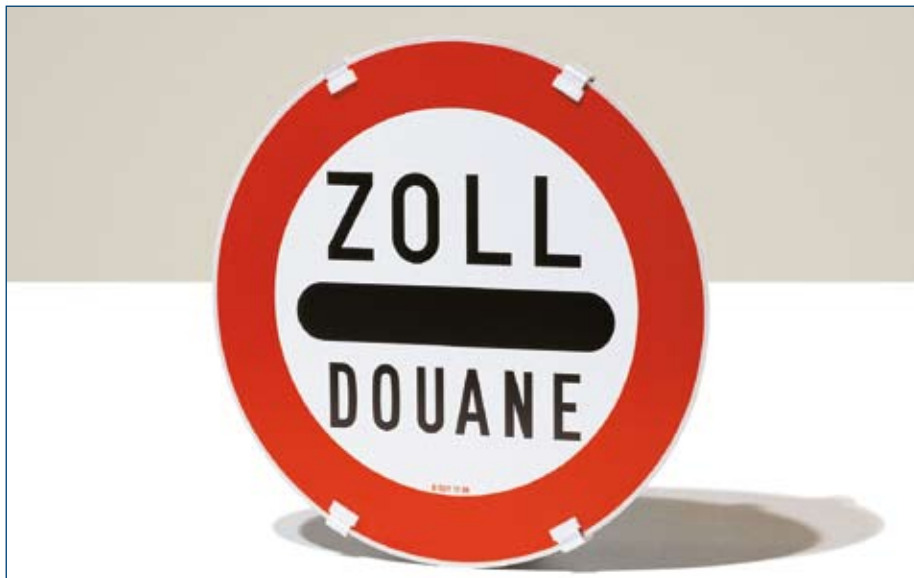
Serbia is on its way to liberalize the goods traffic with the EU.

Thus Serbia makes the first move in direction of its future EU-accession.