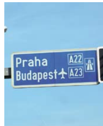
Nearly 22 per cent of all shipments from Austria go to Eastern Europe.

Especially pleasing is the increase of exports to Eastern Europe. Compared with the same period of the previous year, the amount of exports in this sector grew by 15,7 per cent during the first ten months of 2007. In the first ten months of 2007 the positive trade balance with Eastern Europe amounted to some € 0,5 billion. Since the opening of the East Austrian exports to this region have increased tenfold. Presently 21,8 per cent of all shipments from Austria go to Eastern Europe. Thus after Germany this region is Austria's second largest trading partner.