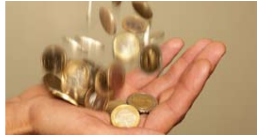
A relatively low income tax rate does, in fact, increase the employers' willingness to register illegal workers.

The flat tax also has an influence on the public funds. Because of the flat tax Bulgaria hopes to gain more than € 280 million additional tax revenues. Since the introduction of the uniform tax rate of